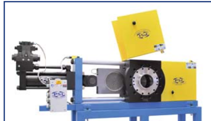
Hydraulic Screen Changer