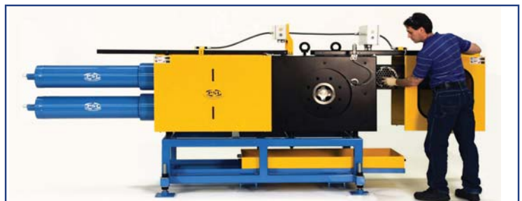
PLC-Driven Backflush Screen Changer

Our gear pumps are the best in the industry! All gear sets are precision ground and through hardened to provide better gauge control, higher output rates and increased screw and barrel life.