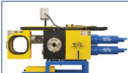
Continuous Screen Changer