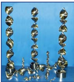
Uniflo Static Mixer