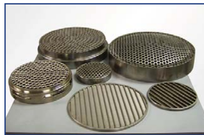
Breaker Plates, Super Plates, etc.

We stock a broad inventory of spare parts such as breaker plates, super plates, HPU's, gears, bearings, heaters, hydraulic cylinders and much more.